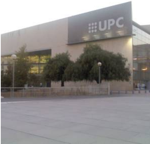
2011 Membranes Conference.