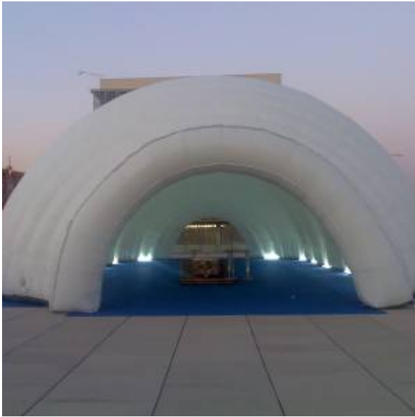
2011 Membranes Conference.