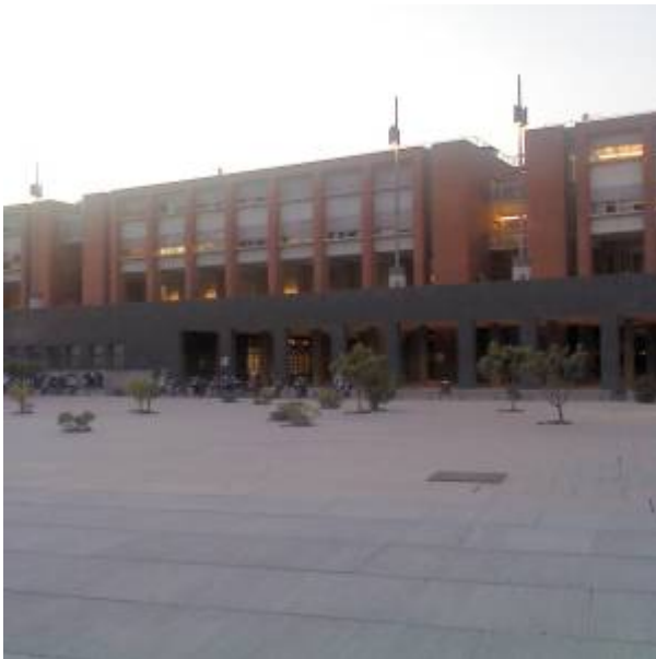
2011 Membranes Conference.