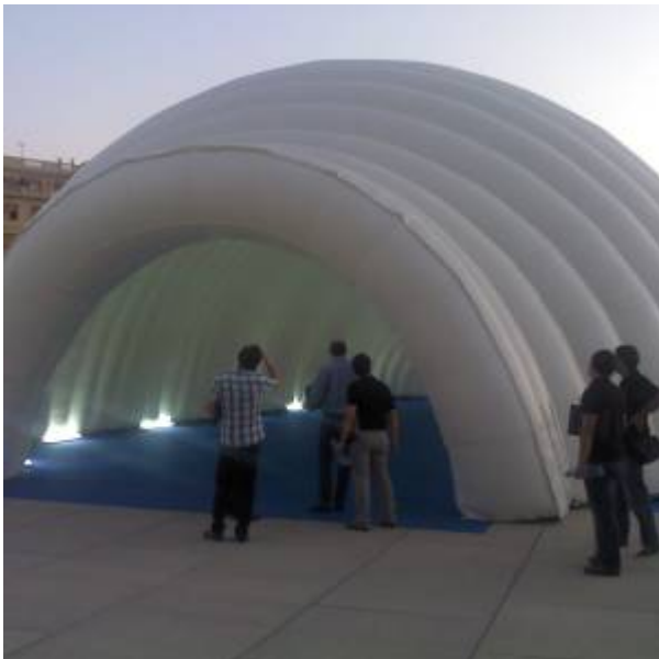
2011 Membranes Conference.