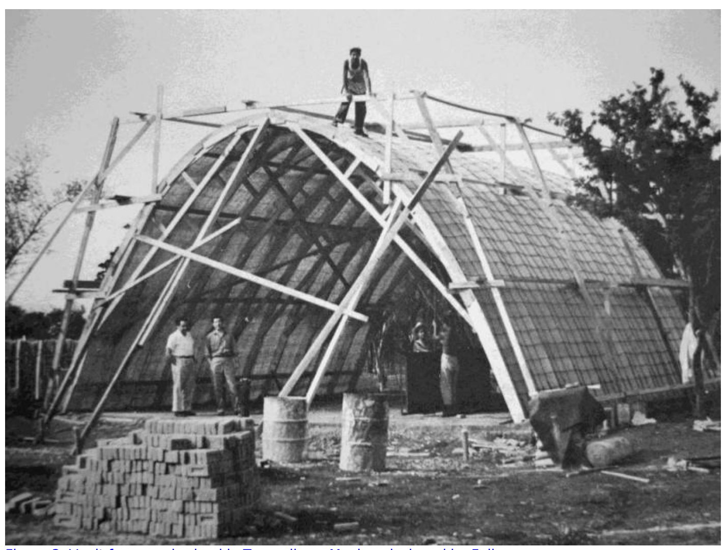
Figure 3: Vault for a rural school in Tamaulipas, Mexico, designed by Felix...

reinforced concrete shells (Figure 3). Burlap fabric stretched over timber arches was the simple formwork he used to form ribbed, parabolic shells [5]. In the 1970's Spanish architect Miguel Fisac successfully used plastic sheets as formwork for textured wall panels. His technique was used to form architectural wall panels (Figure 4) in several buildings [6]. Further practical applications occurred in the mid 1960's with the introduction of fabric formwork for erosion control and pond liners (Figure 5). The efforts of E.W. Bindhoff [7], B.A. Lamberton [8], and others led to the first sustained commercial applications of fabric formworks.