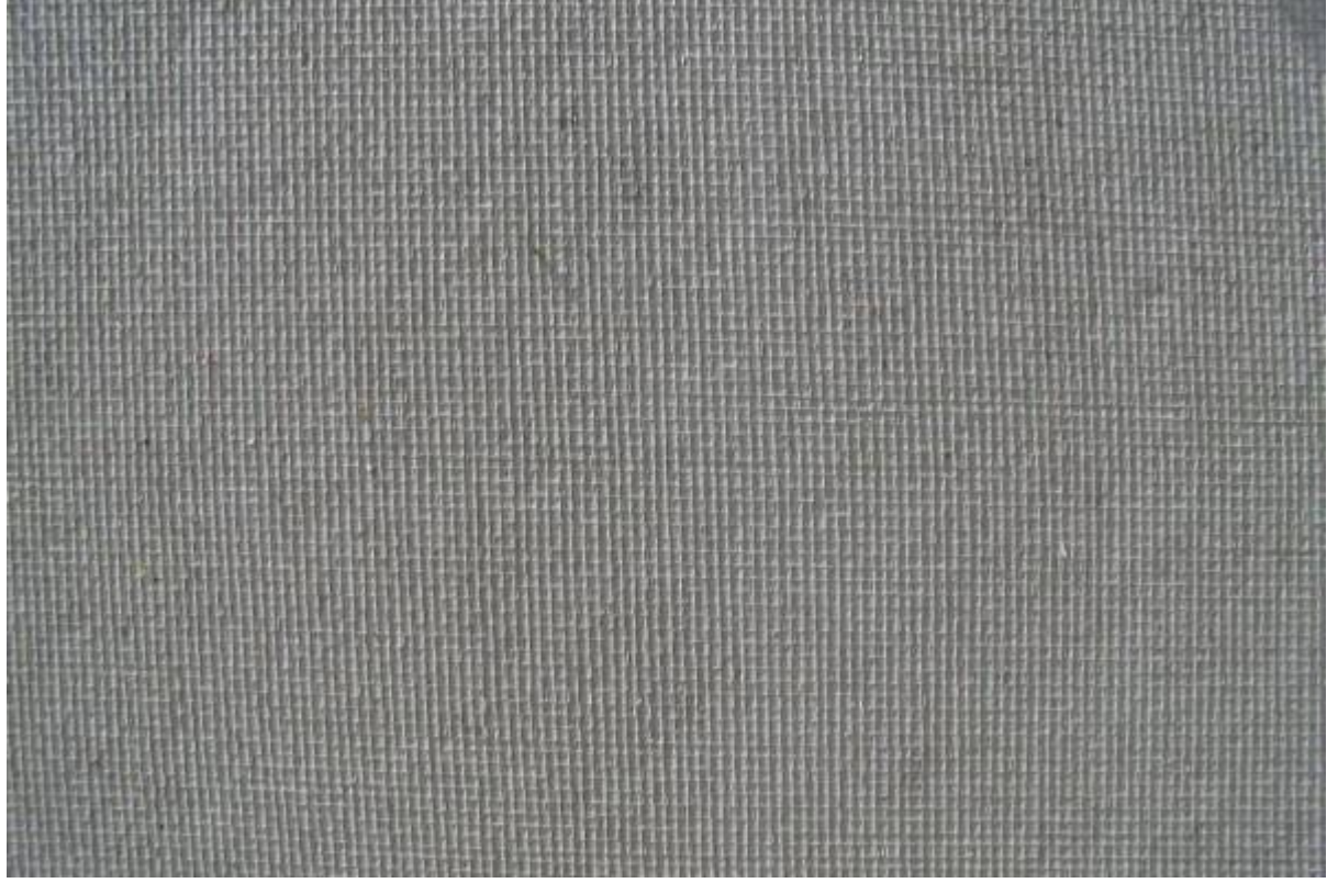
Figure 1: Close up view of the texture of a fabric formed concrete wall.

The surface finish of concrete formed in wood, steel or plastic molds generally has imperfections, often requiring further touch ups and costly treatments (Figure 2). Lumber and plywood used for conventional concrete forming are often used a few times and then sent to the landfill site. Creating curves and organic forms using conventional concrete forming is also time consuming, expensive and labour and material intensive. Fabric formwork can use a flexible woven nylon, polyolefin, polyester, polypropylene, polyamide, or polyethylene membrane instead of rigid conventional forms or panels [1]. When fresh concrete is poured inside this membrane the fabric mold deflects into a repertoire of precise tension geometries.