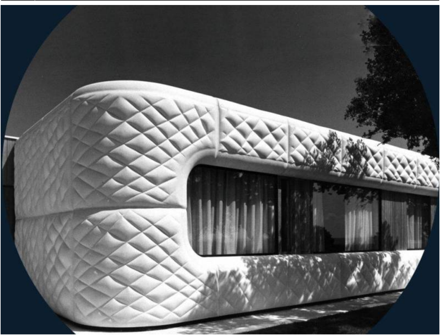
Figure 4: Prefabricated cladding for a house formed with flexible formwork and...