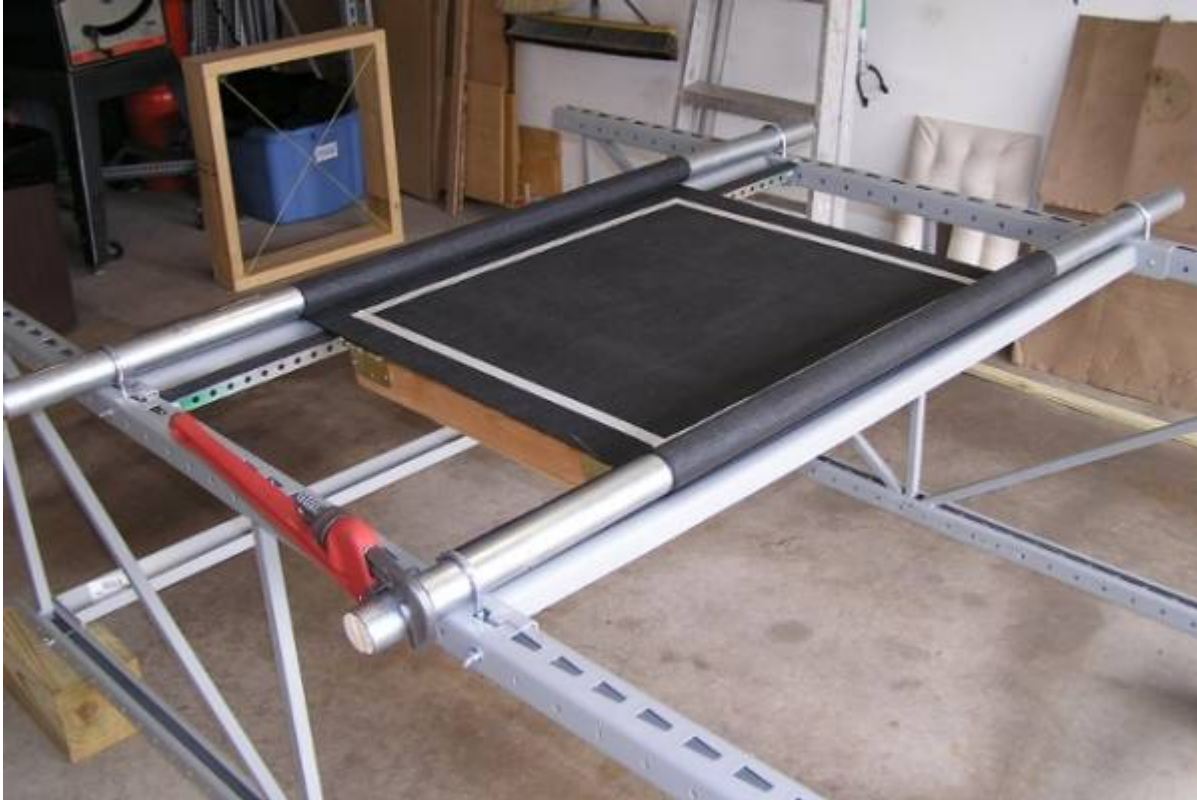
Figure 3: Test Frame with Fabric.