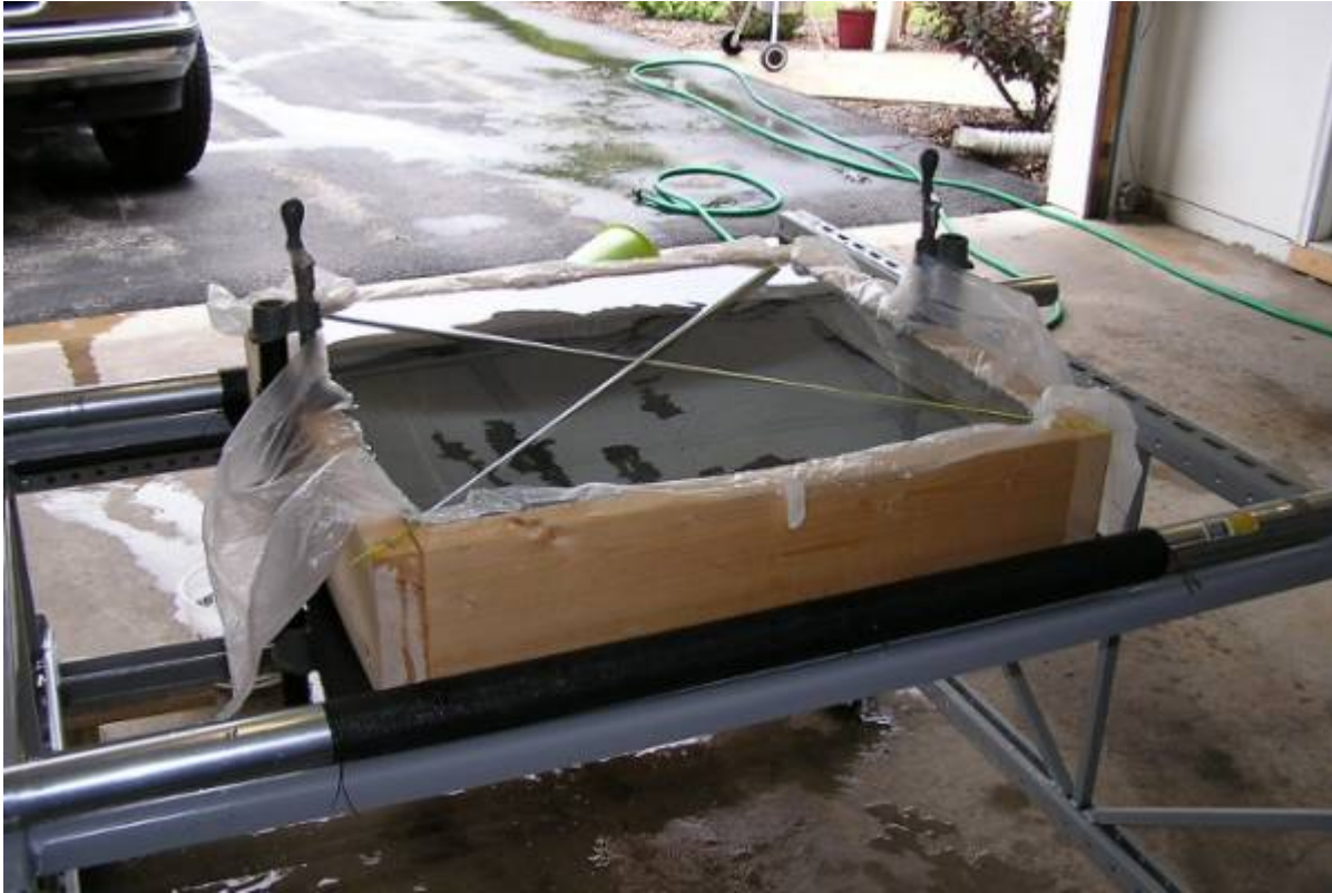
Figure 5: Test Frame with Loaded Fabric.

For this Phase water will be used to load the fabric as shown in Figure 5. After each test is completed the panels will be unloaded and the fabric allowed to return to its original state. The reason for this is to determine whether the fabric can produce results that are consistent and repeatable. This will aid in determining whether the fabric may be reused .