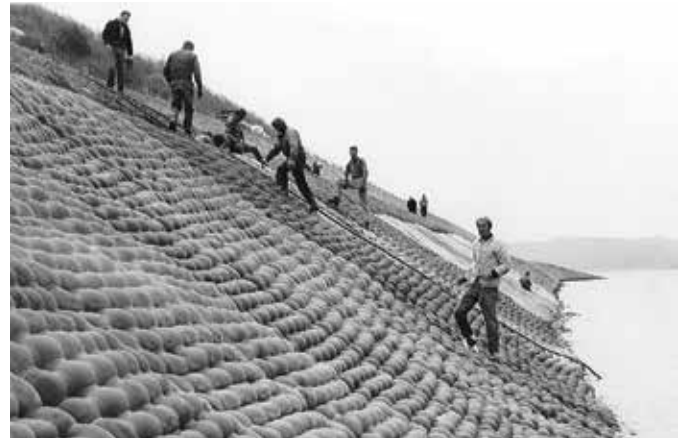
Fig. 1: A revetment (Fabriform® Filterpoint) is installed in 1967 on the Allegheny Reservoir, New York

Because fabrics can only resist tension forces, however, fabric formworks often require rigid boundary conditions. Exceptions include revetments that are “inflated” on the ground by pumped grout (Fig. 1). Boundary supports can also be minimal—for example, a tube can be formed by joining two parallel edges of a fabric sheet, and the tube can be suspended from open scaffolding (Fig. 2). Boundary supports may also be more restrictive, such as an external frame, cage, or other lateral restraints. In every case, the fabric will assume