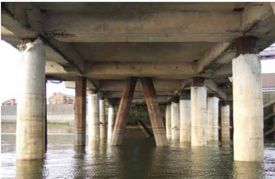
Fig. 4: Sleeve formwork can be used to form jackets for repair of damaged piles 13

Sleeves are also used to create columns in earth cavities below the floor of a structure. This technique involves drilling holes through the floor of a structure and snaking a fabric tube down the hole with the assistance of a steel pipe. This technique solves the problems associated with grouting or backfilling cavities in areas underlined by mines or scouring.