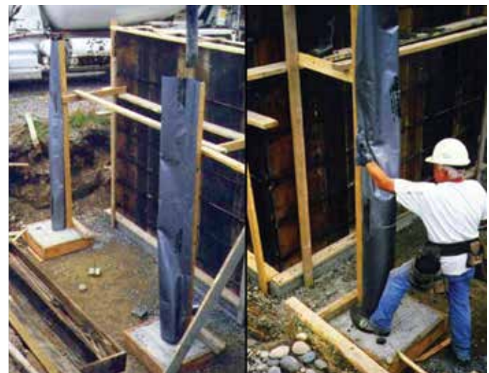
Fig. 2: Fast-Tube™ is a commercially available column fabric formwork system