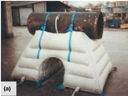
(a) Fig. 3: Bags and mattresses are economical choices for forming concrete foundations and blankets: (a) a pipeline foundation element; and (b) canal liners and breakwater protection 12,14