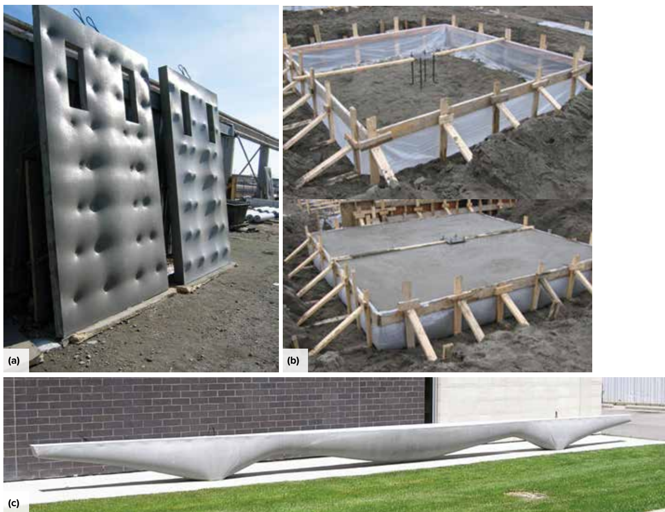
Fig. 6: Open trough fabric forms: (a) site-cast precast panels; (b) spread footings; and (c) precast variable-section beams

filled from above with concrete. This is probably the first application of fabric forms, as it is described in the United States. 2,12 Applications include precast panels (Fig. 6(a)), strip or pad footings (Fig. 6(b)), and CIP or precast-ribbed slabs or variable-section beams (Fig. 6(c)). 2