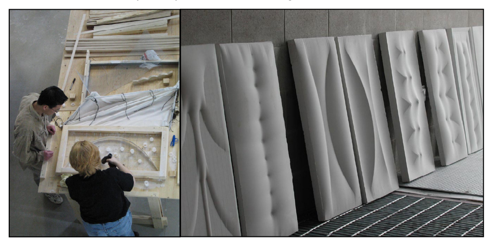
Figure 3: Model formwork and completed plaster casts. (C.A.S.T. photos).

wet concrete. The completed panel is shown in Fig. 5.