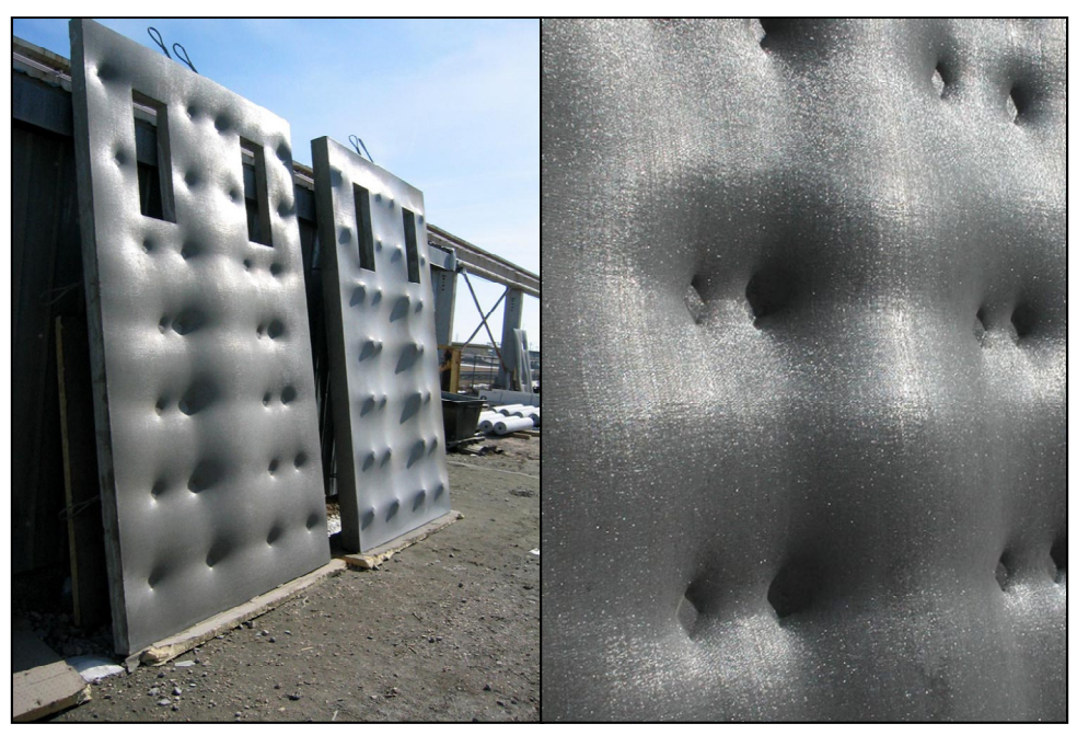
Figure 5: Completed concrete wall panels and surface detail. (C.A.S.T. photos).