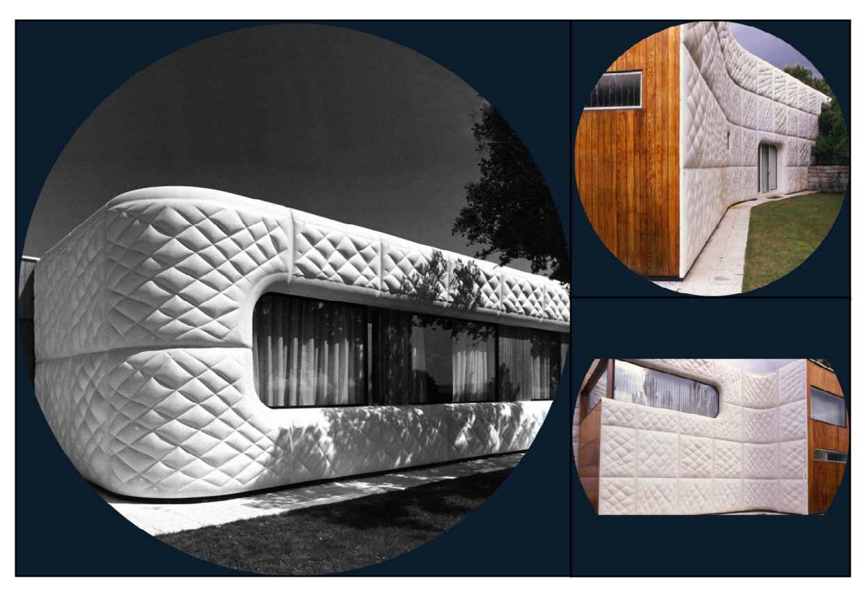
Figure 1: Juan Zurita residence (Studio Miguel Fisac).