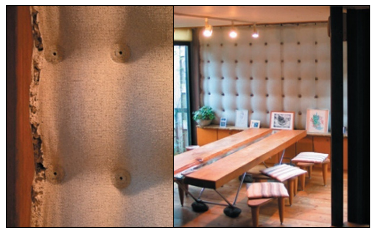
Figure 2: Quilt-like formwork pattern used for the Eiji Hoshino Residence.